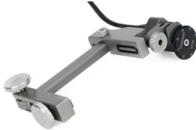
ODI - SINGLE PROBE